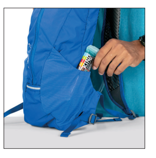
DUAL STRETCH MESH SIDE POCKETS 7L / 3L Dual stretch mesh side pockets for quickly stashing gear.