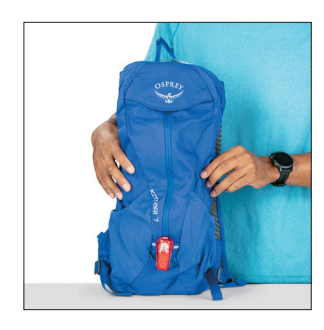
BLINKER LIGHT ATTACHMENT 7L / 3L / 1.5L Blinker light attachment and reflective patch for safety.