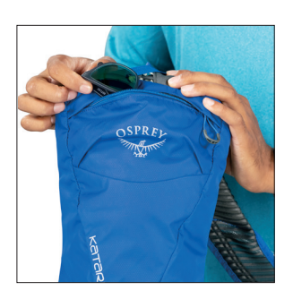
SLASH POCKET 7L / 3L / 1.5L Zippered slash pocket for sunglasses or electronics.