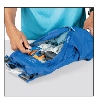
VERTICAL-ZIP COMPARTMENT 7L Front panel vertical-zip compartment with tool organization.